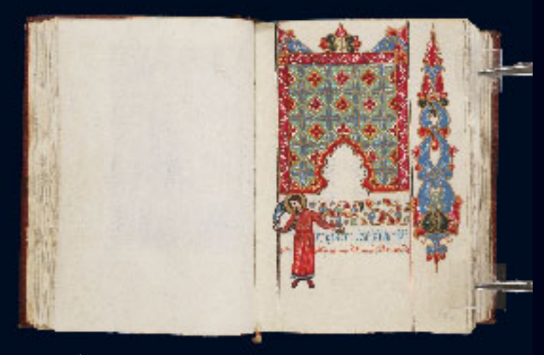
17th century Armenian Book of the Gospels, frontispiece to the Gospel of Matthew with zoomorphic letters. Ms. Bzommar 22, fols. 45v-46r.

Here we feature four of the Hill Museum & Manuscript Library's ten current manuscript preservation projects. Future issues of Illuminations will profile additional projects elsewhere in the Middle East and in Europe. To find out more about how HMML preserves these manuscripts for long-term access, see the article on page three or visit www.hmml.org.