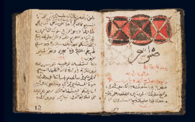
Opening pages of a 19th century Arabic book of Christian prayers for lay people. Ms. BO-USJ 907, fols. 13r-12v.