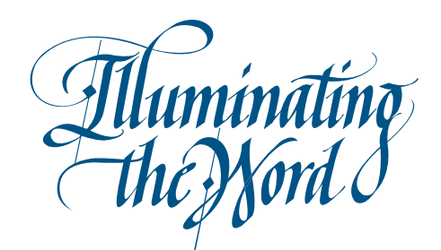
THE SAINT JOHN'S BIBLE

HMML reached the second benchmark set by the National Endowment for the Humanities (NEH) in a Challenge Grant to raise $2.25 million for endowment of its Malta Study Center. As part of a four-year fundraising drive launched in 2003, the NEH provides a $1 match for every $4 raised by HMML for the center. The NEH set fundraising benchmarks that must be met in order to receive the match. HMML must now raise $600,000 in FY 05-06 to meet this benchmark. To make a matching gift, visit our website. The endowment will fund a curatorial position, acquisitions, programming and preservation of rare manuscripts and documents related to Malta.