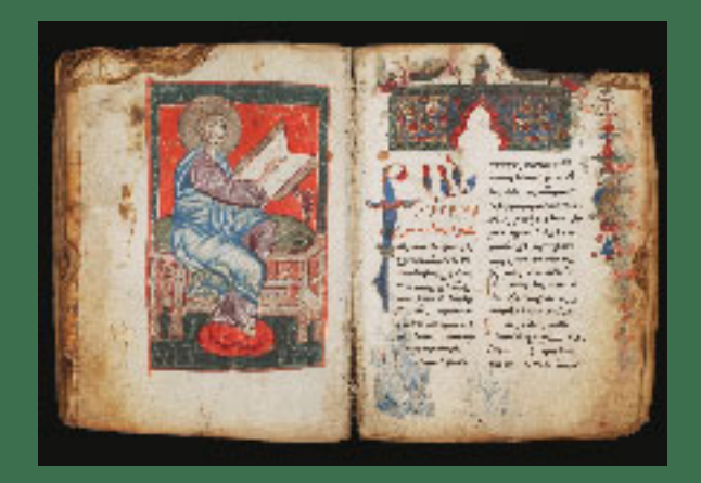
Front cover: 14<sup>th</sup> century Armenian Book of the Gospels, frontispiece to the Gospel of Luke. Ms. Bzommar 18, fols. 128v-129r.