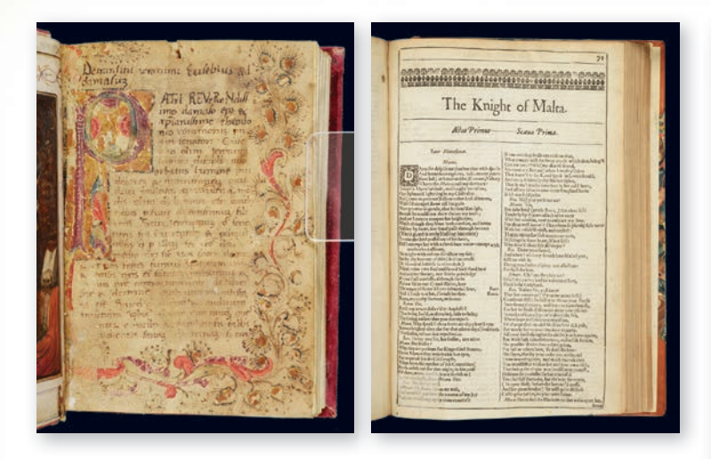
LEFT: A tiny early modern manuscript on the life of Saint Jerome. This manuscript was part of a large anonymous gift given to HMML in late 2016.

RIGHT: This 1647 edition of plays by Beaumont and Fletcher includes a work about Malta. The book was given as a part of the same gift to HMML in late 2016.