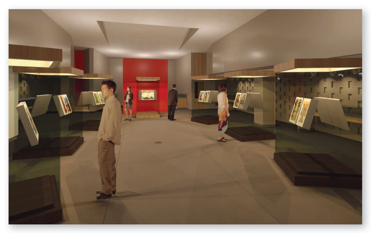
An architect's rendering of the new gallery for The Saint John's Bible, set to open on the lower level of Alcuin Library in October 2017.

On February 20, 2017, the completed renovation was opened to the campus community. The renovation features more open study areas, collaborative space for student group work, and compressed shelving for the library's print collection. The new space also showcases the two concrete Trees of Knowledge, designed by the building's original architect Marcel Breuer, that anchor the main floor of the library.