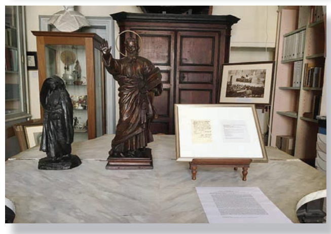
Exhibit for the "Receipt for the Medical Care of a Slave." Archivum de Piro. Box 13. Bundle 7. Item 2, dated 16 November 1726.