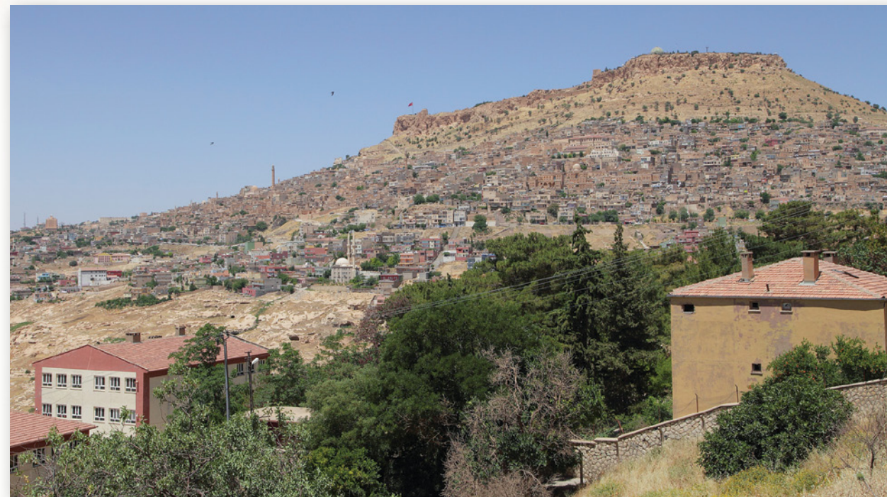
ABOVE: A view from the southwest of the city of Mardin, a UNESCO World Heritage Site built on a rocky hill rising above the surrounding plains, showing the city arrayed around the ancient hilltop citadel. FACING PAGE: Traditional transportation carries a traveler past the newly renovated Chaldean Cathedral in Mardin. For years it was hidden behind a protective wall that rendered it invisible to passersby.

in 1923 focused on Syriac Christians. The Christians of Mardin were reduced to a tiny remnant.