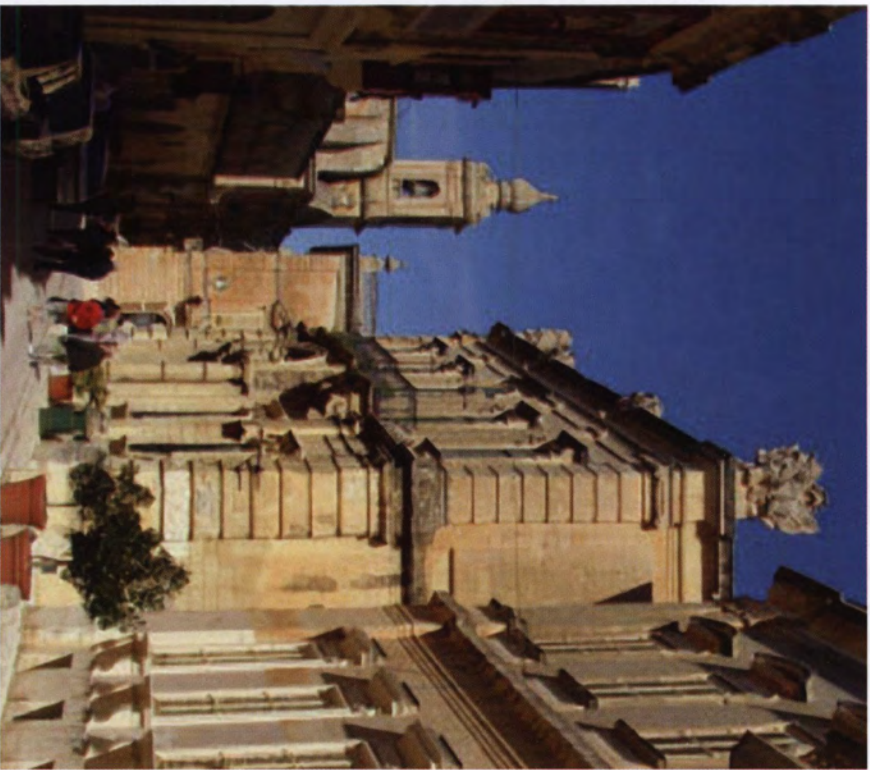
The Banca Giuratale, the location of the Magna Curia Castellaniae, in Mdina, Malta.

THE MALTA STUDY CENTER HILL MUSEUM & MANUSCRIPT LIBRARY SAINT JOHN'S UNIVERSITY Collegeville, Minnesota 56321-7300 (320) 363-3514 www.hmml.org