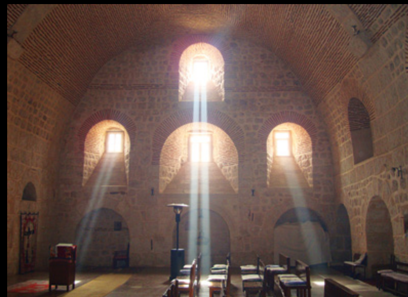
LEFT: The Church at the Monastery of Mor Gabriel.

While the monastery has been the object of more recent constructions, very old parts of it remain. Syriac inscriptions from the sixth century and later survive and give some details of the monastery's history and inhabitants.