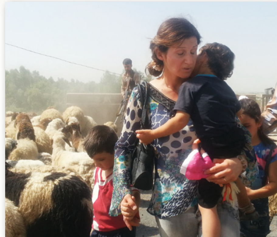
LEFT: Christian refugees from Qaraqosh heading to safety in Erbil in August 2014.