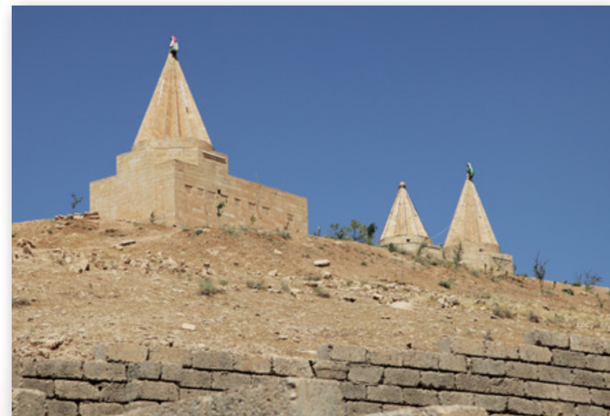
LEFT: Yazidi shrines in northern Iraq. Much of this region is now behind ISIS lines.

team at CNMO is rebuilding their capacity to digitize what they managed to bring with them, and to search out other collections as yet unknown. The scale of their achievement over the past several years is astonishing: some 5,000 manuscripts, from dozens of libraries, many of them now behind IS/ISIS lines and feared lost. The only access to any of them, for the time being, and perhaps forever, is through the digital versions created by CNMO. HMML has deployed an international team of catalogers to work on these collections so that their contents can become known and used by scholars around the world.