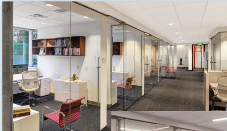
ABOVE: HMML staff offices.

Staff offices and work spaces have been redesigned to support digital library services, as well as traditional curatorial activities. New heating and air conditioning systems, as well as fire and security systems, provide an optimal environment for HMML's collections and for those who use them.