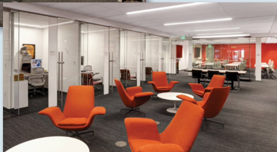
BELOW: View of scholar study spaces from the HMML Reading Room, with a view of the exhibition space and classroom in the distance.