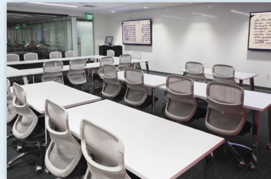
BELOW: View of HMML's Maxine H. Wallin Classroom which seats up to 25 and supports a wide range of media. The Classroom has seen much use since our new space opened.

HMML's main entrance has been reoriented to a foyer connected to Saint John's University's Alcuin Library, making HMML's Reading Room and scholar studies accessible during Alcuin Library's open hours. HMML's reference collection and other scholar services are available during HMML's open hours from 8 a.m. to 4:30 p.m. Monday through Friday. Visitors are always welcome!