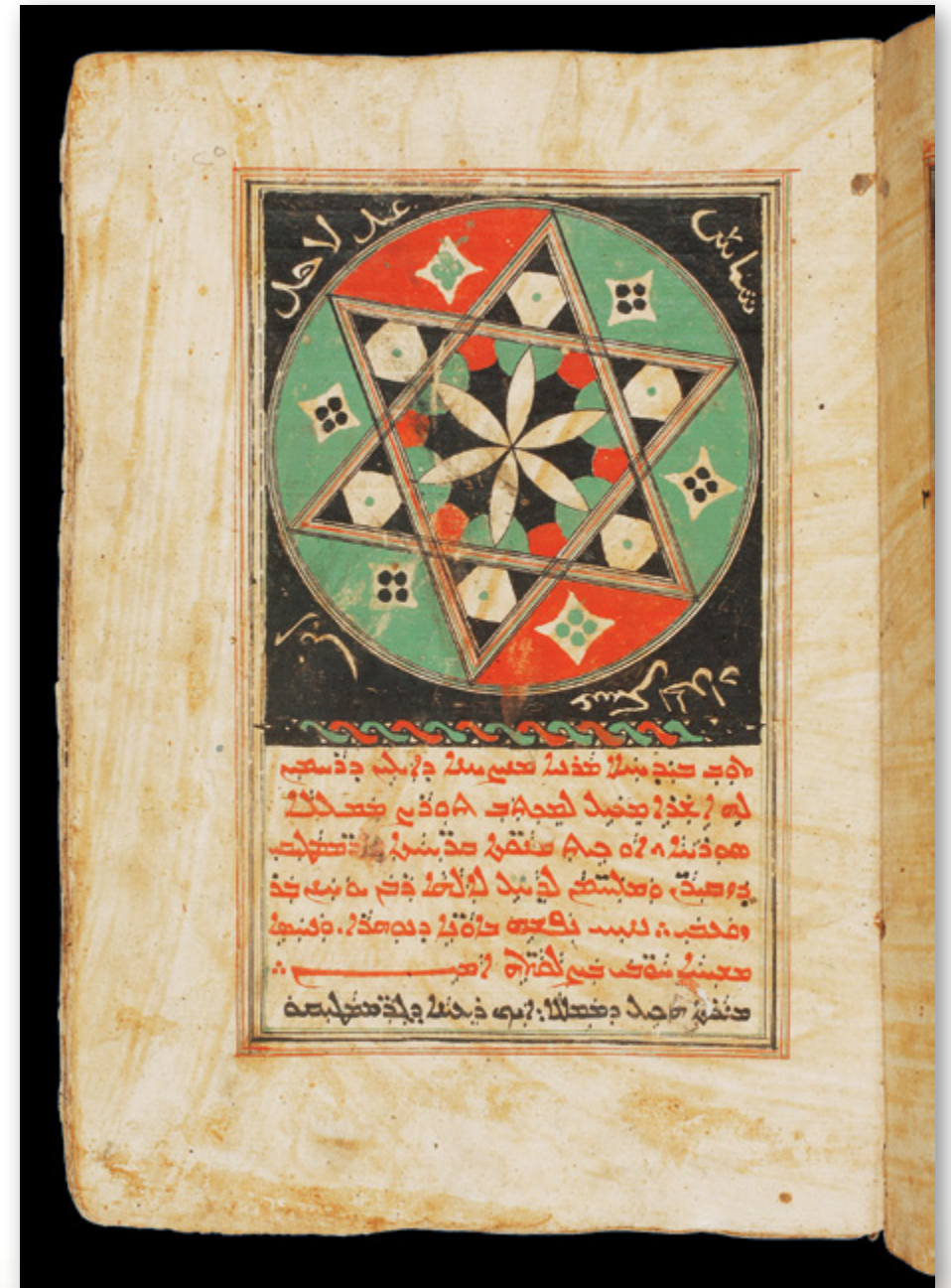
RIGHT: Eliya of Nisibis, Yoḥannan Bar Zo'bi, et al., Fundamentals of the Syriac and Arabic Languages, a 17 th -century manuscript in Syriac and Arabic from the Chaldean Archdiocese of Kirkuk, Iraq. ACK_00075, fol. 25r, dated 1682 CE. Manuscript on paper. 31.5x21x6 cm.

equally threatened by the narrow-minded fanaticism of ISIS and other groups. The manuscripts evacuated from Timbuktu before the fundamentalists arrived, the libraries of the great Muslim families of Jerusalem, the Ethiopian Islamic manuscripts of Harar, all fit HMML's commitment to ensure that human handwritten culture is safe. All of the Hebrew manuscripts in the world have been photographed by a project based in Israel; the vastly greater number of Christian and Islamic manuscripts demands an equally thorough response. It is our privilege to be among those providing it.