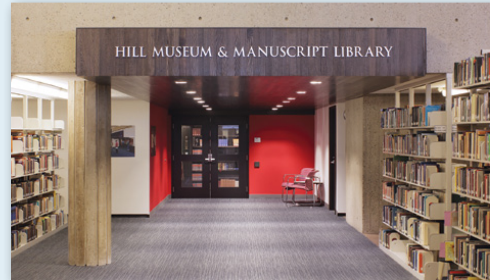
LEFT: View of the new public entrance to HMML through Alcuin Library.