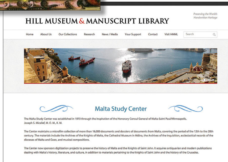
Right: The current Malta Study Center website page, now part of www.hmml.org .

successful completion of the NEH Challenge Grant has opened up many opportunities for the Center. In addition to establishing digital projects, the endowment supports collection development, exhibits, public events, and scholarly outreach. All this extends the reach of the Center and continues to make it one of the most important resources for Maltese (and Mediterranean) culture outside of Malta itself.