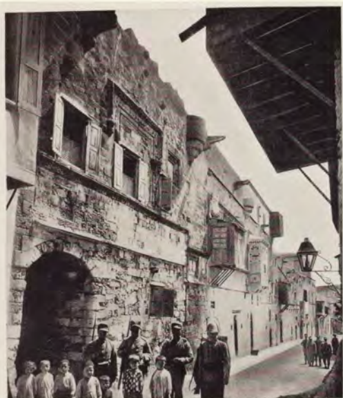
FIG. 115 — RODI - LA VIA DEI CAVALIERI PRIMA DEI RESTAURI.

Bottom Right: The same building in 2011. Note the removal of the wooden balconies and the replacement of windows, doors and arches. (Photo: T. Vann).