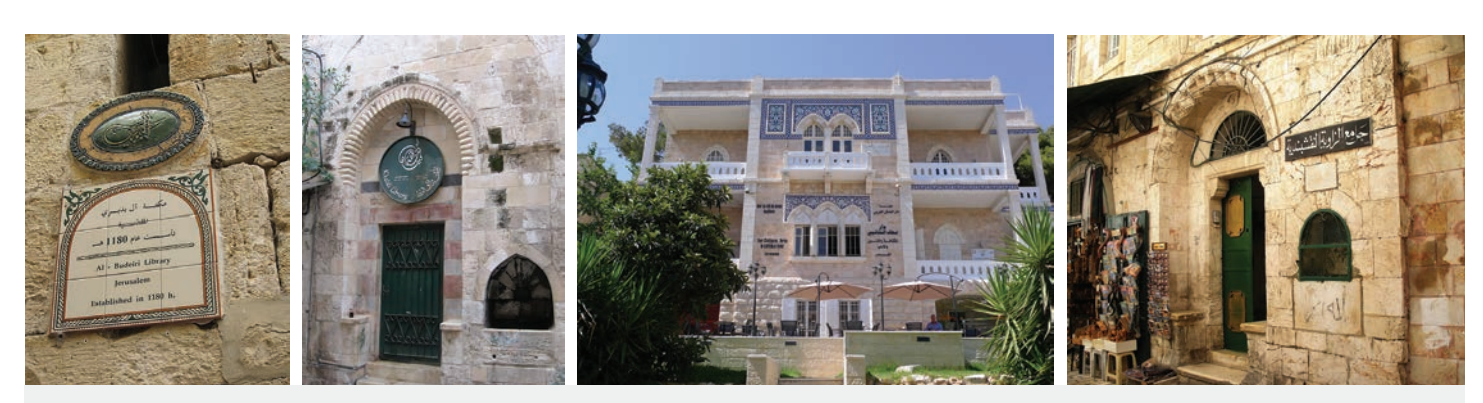
ABOVE: (Left to right) Āl Budeiry Library, Khalidi Library, Issaf Nashashibi Library, and al-Zāwiyah al-Uzbakīyah.