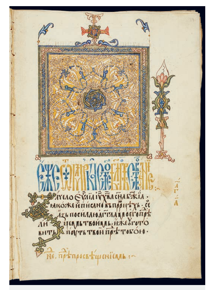
ABOVE : The beginning of the Gospel of Mark, written in Church Slavonic. This gospel book was digitized in Pakrac in partnership with the Serbian Orthodox Eparchy of Slovania. (SOCES 00001)

The manuscripts in these collections are heavily theological, liturgical, or biblical in content. They range in age from the medieval to early modern periods, with the collection at Cetinje particularly notable for medieval parchment codices containing early Slavonic translations of Greek texts, many accompanied by impressive illuminations. Digitization is currently ongoing, with completed manuscripts awaiting cataloging.