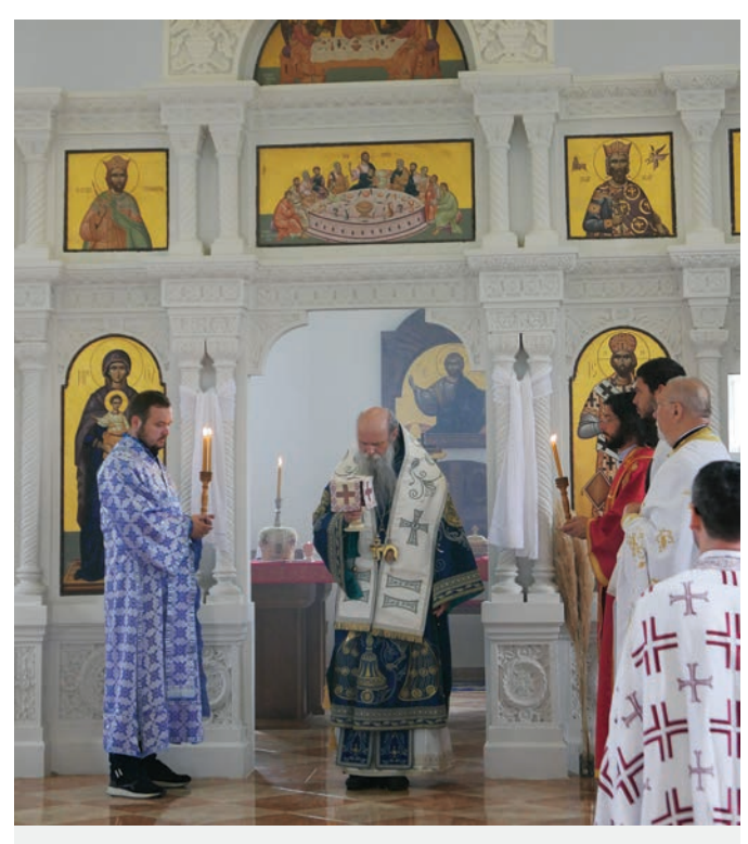
ABOVE : HMML partner and project sponsor Bishop Jovan Ćulibrk, at liturgy in his church in Pakrac, Croatia. Ćulibrk is the bishop of the Serbian Orthodox Eparchy of Slavonia.

The manuscripts in these collections are heavily theological, liturgical, or biblical in content. They range in age from the medieval to early modern periods, with the collection at Cetinje particularly notable for medieval parchment codices containing early Slavonic translations of Greek texts, many accompanied by impressive illuminations. Digitization is currently ongoing, with completed manuscripts awaiting cataloging.