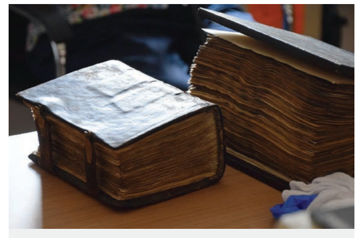
ABOVE: Manuscripts in Pakrac, awaiting digitization.

The Balkan region is very important for the history of Slavic linguistics, as it is the only place that preserved the original form of the Slavic writing system devised by Saint Cyril in the 9th century. In Croatia and the Dalmatian coast, Slavonic was written using Glagolitic script until the early 19th century. We hope to find Glagolitic manuscripts as our work expands.