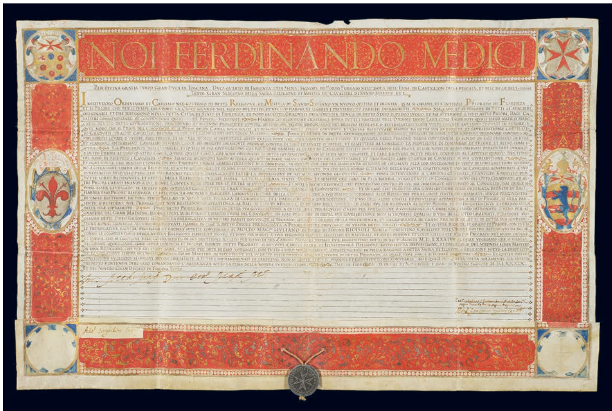
Above: Privilege of Ferdinando I, Grand-Duke of Tuscany, concerning the foundation of the Priory of Florence of the Sacro militare ordine di Santo Stefano papa e martire, 1589 November 8. HMML Project number HMML 00452.