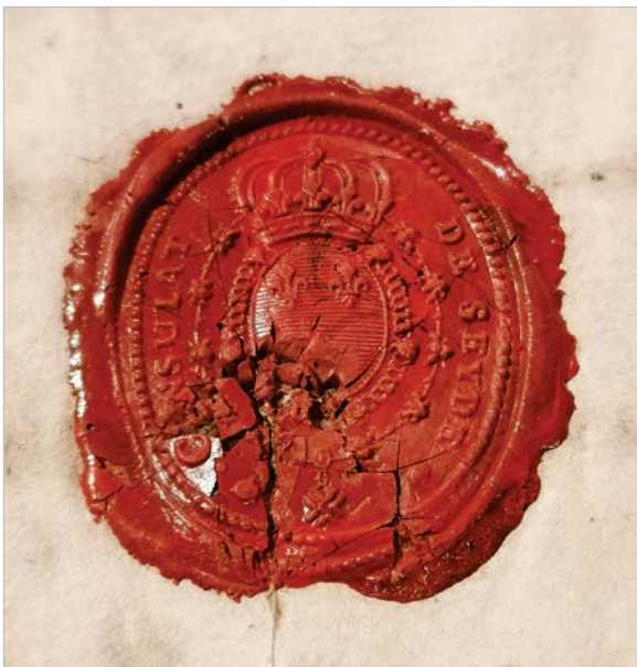
Left: Wax seal of the Consulate of Sidon (Lebanon). Lettere consolari fonds, Cathedral Archives, Mdina.